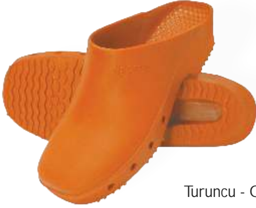
Turuncu - Orange