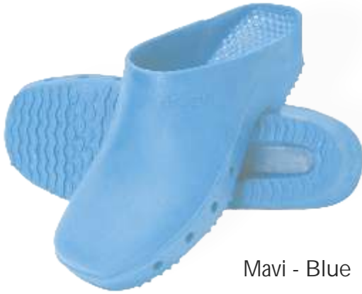
Mavi - Blue