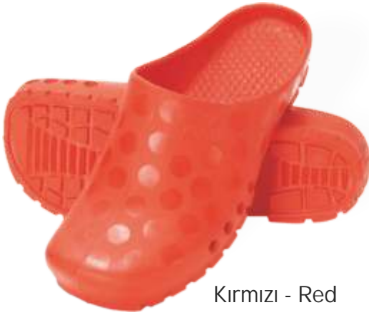
Kırmızı - Red