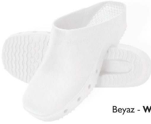
Beyaz - White