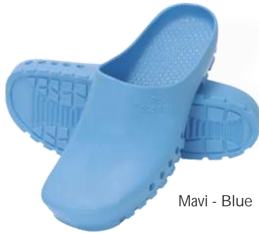
Mavi - Blue

Ebatlar : 36-37 / 38-39 / 40-41 / 42-43 / 44-45