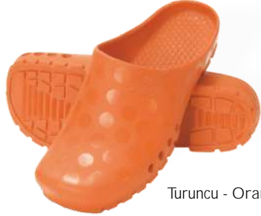
Turuncu - Orange