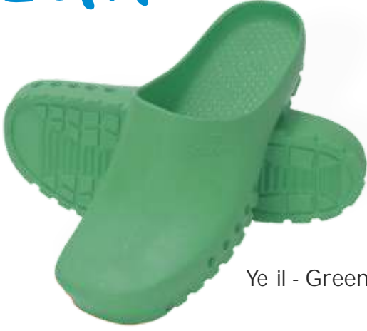
Ye il - Green