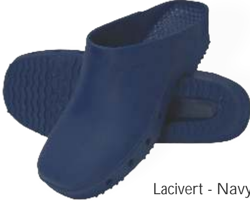
Lacivert - Navy Blue