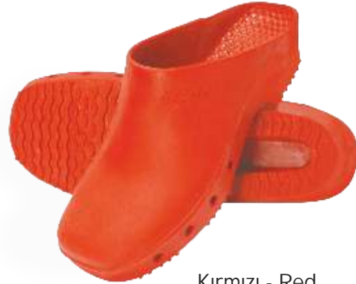
Kırmızı - Red

Ebatlar : 34-35/36-37 / 38-39 / 40-41 / 42-43 / 44-45