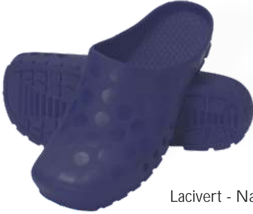
Lacivert - Navy Blue