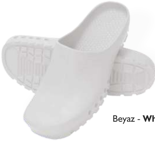
Beyaz - White