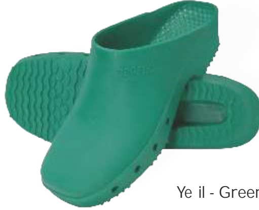
Ye il - Green